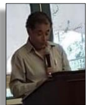
Former President of Valley Byliners